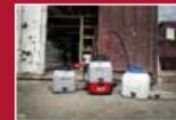
The interchangeable tank design