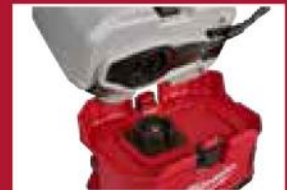
Add on and replace tank assemblies to eliminate cross-chemical contamination