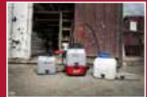
The interchangeable tank design