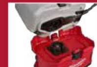
Add on and replace tank assemblies to eliminate cross-chemical contamination